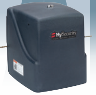
Slide Gate Operator

Ultra Reliable/Low maintenance • Variable speed • Easy, inexpensive installation • Solar